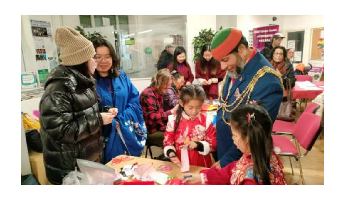
Other Wonderful Moments